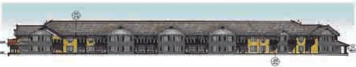
E NORTH ELEVATION Scale: 1/8" = 1'-0" (1/4" = 1'-0" FOR ROOF LINE)