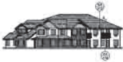
D SOUTH ELEVATION Scale: 1/8" = 1'-0" (1/4" = 1'-0" FOR ROOF LINE)