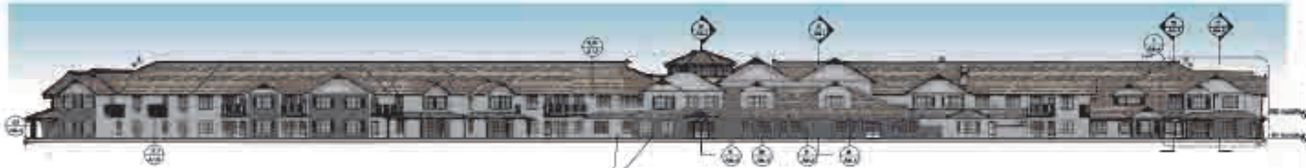
A EAST ELEVATION Scale: 1/8" = 1'-0" (1/4" = 1'-0" FOR ROOF LINE)