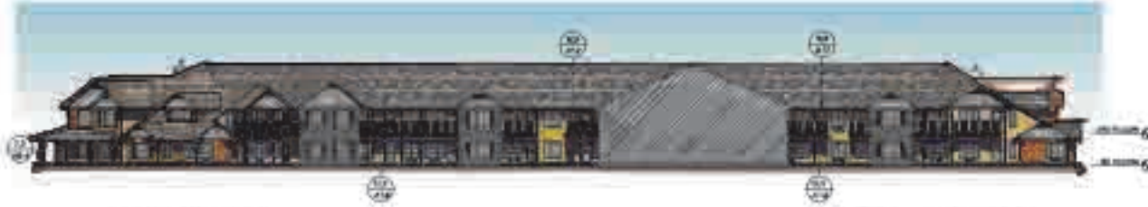
F SOUTH ELEVATION Scale: 1/8" = 1'-0" (1/4" = 1'-0" FOR ROOF LINE)