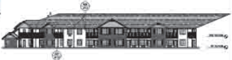
C SOUTH ELEVATION Scale: 1/8" = 1'-0" (1/4" = 1'-0" FOR ROOF LINE)